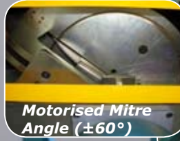
Motorised Mitre Angle ( \pm 60^\circ )