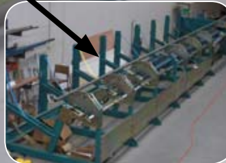
High Capacity Bundle Tube Loader