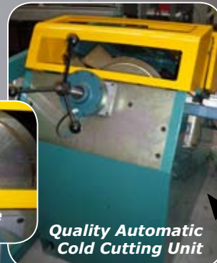
Quality Automatic Cold Cutting Unit