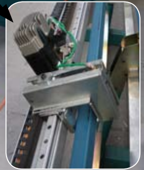
High Accuracy Bar Feeder with Pneumatic Clamp